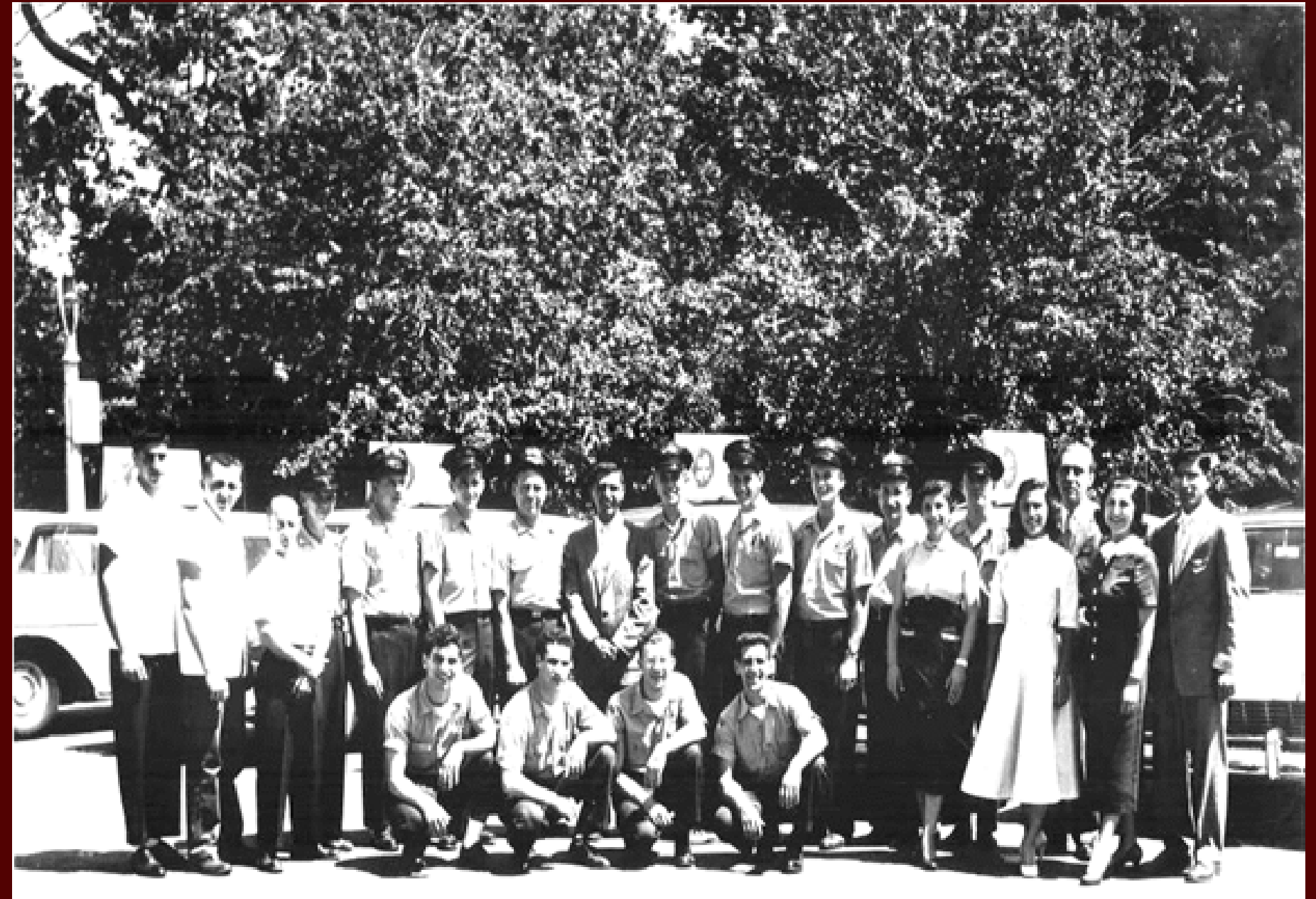
Prisoner of the Truck