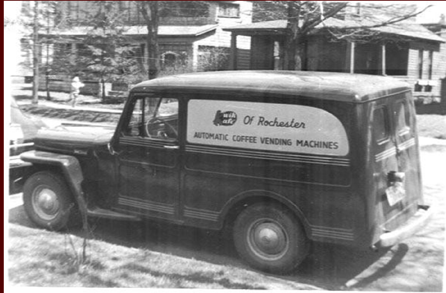
One of our first Kwik Kafe service vehicles. Introduced coffee vending machines to big business