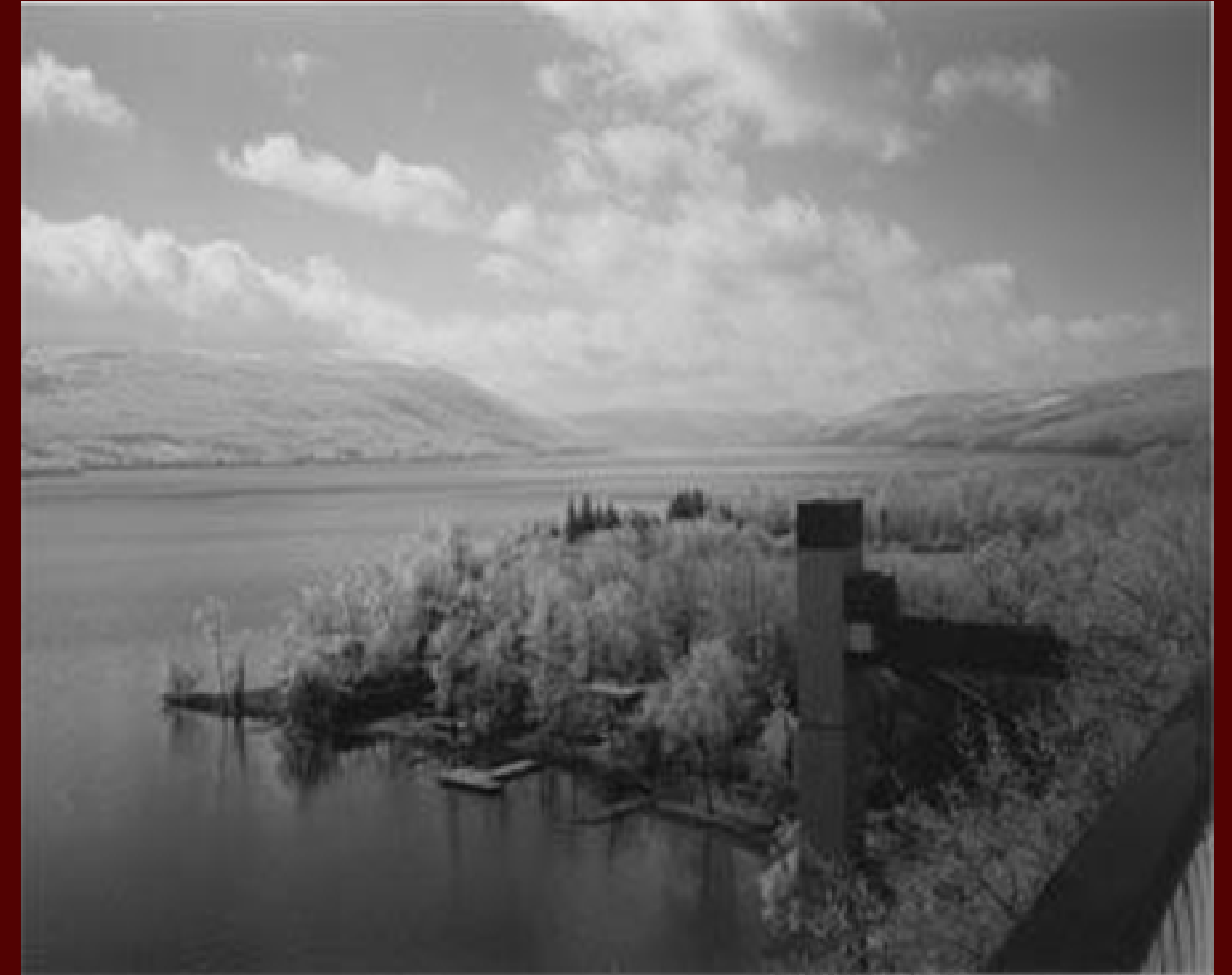
A winter photo from Fred's condominium at Bristol Harbour Village on Canandaigua Lake, New York.