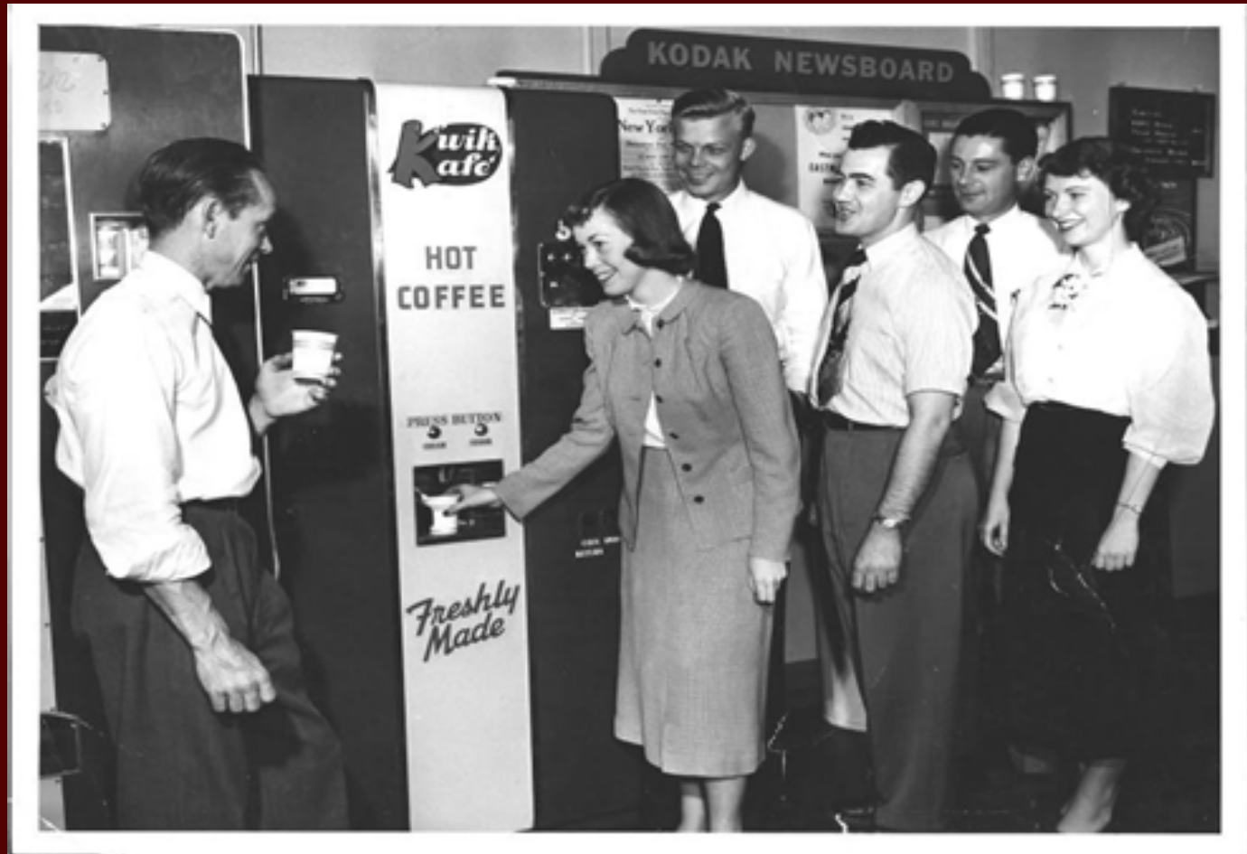
Kodak – one of the Kwik Kafe locations