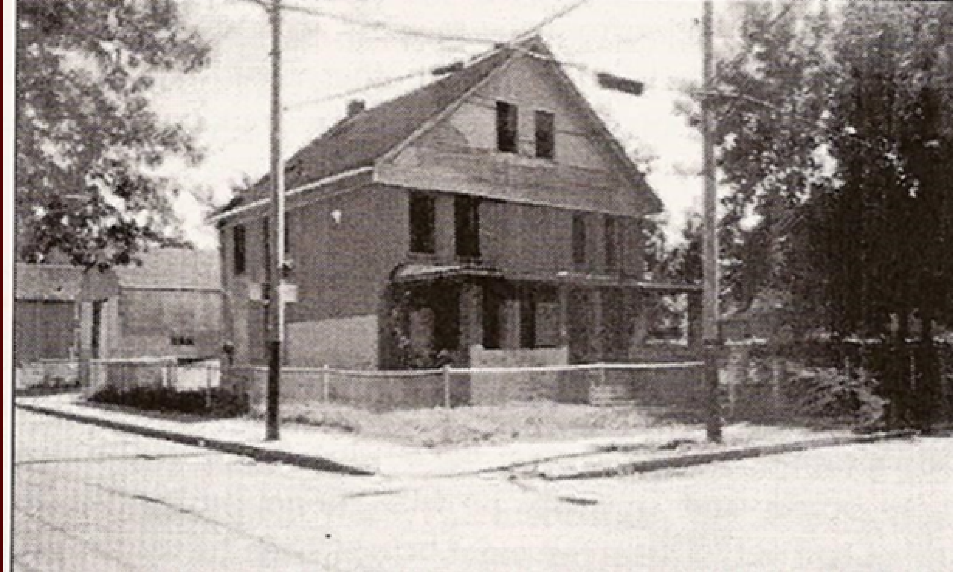
11 Evergreen Street in Rochester, New York We lived in the left half of the house.