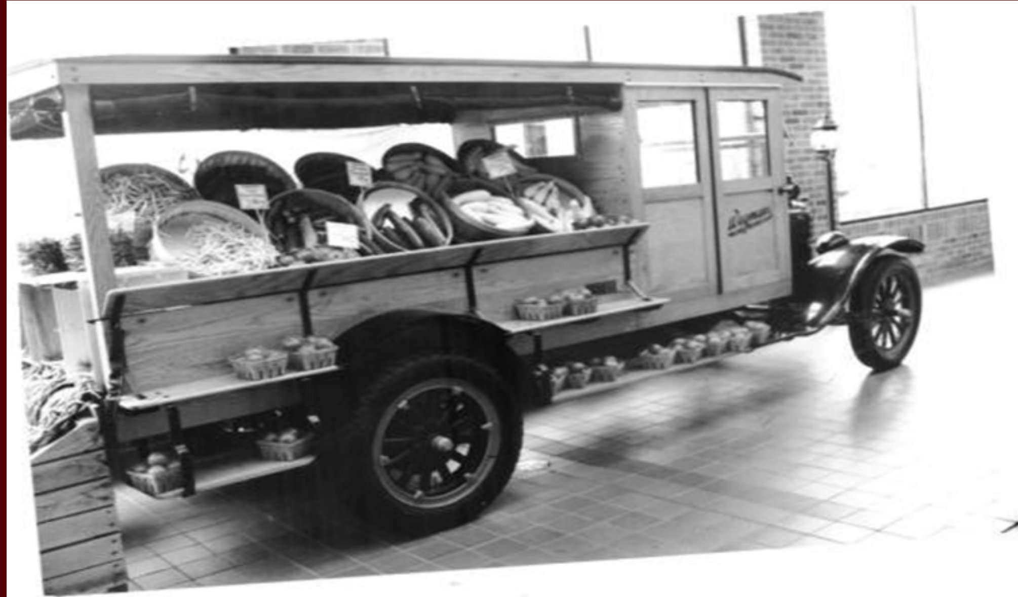
Fruit and Vegetable Truck