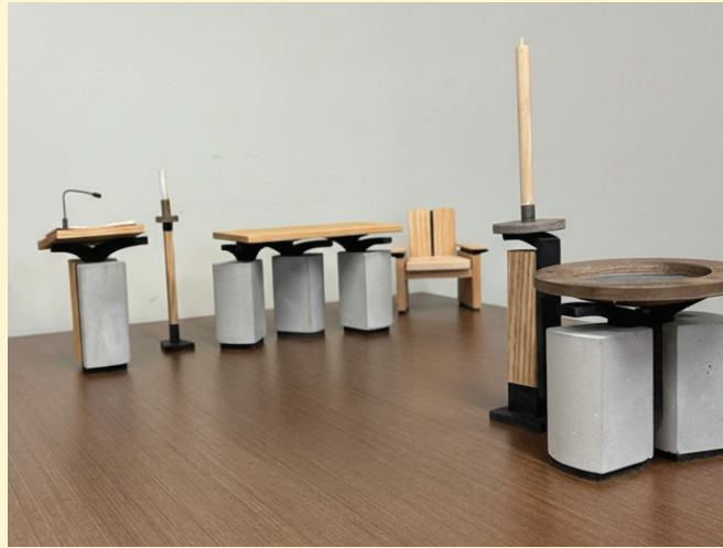
To scale models of the liturgical pieces to be installed in the Carpenter Chapel — offering an early look at the care and craftsmanship of the sanctuary furnishings.

There will be several events commemorating of the opening of the Mack Catholic Center and Carpenter Chapel including a consecration by the Bishop and a special Ribbon cutting ceremony during Meliora weekend in the Fall. We look forward to celebrating the new Mack Catholic Center with everyone!